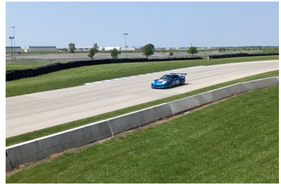
Mike McGinley on track during a GT2 race.

Good news came after they got back to the shop and tore it back down. The new engine was not blown! The wiring harness got burned up and shorted out the spark plugs.