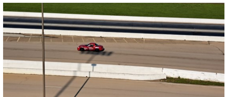
Josh Holsworth on track during a SM race.

were good to go. At times it was like watching a well choreographed routine, flowing seamlessly from one thing to another. And at other times, I got a good chuckle and was reminded that even pros stumble from time to time. It's always fun to see family at the track.