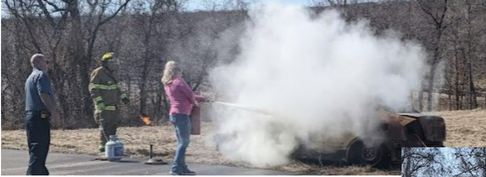
Top: A local resident from Stover, MO puts out the car fire.

Lots of people picked up the fire extinguisher to put out a small car fire. Several more people watched as local fire crews used specialized tools to tear apart a car.