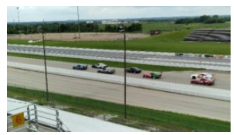
Group 4 race start