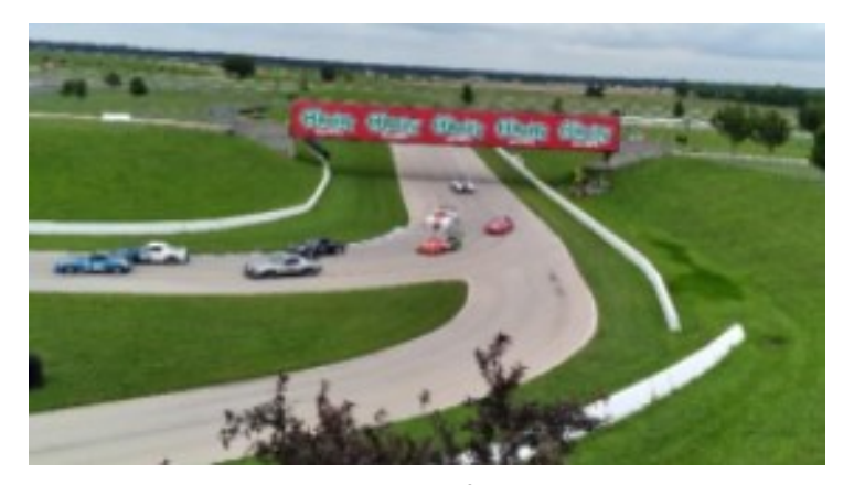
Group 4 preparing for race start

Last but certainly not least, thanks to all the workers who made their way to Heartland Park for this event. You stood in the rain, watched over us, and I hope had some fun as well. Appreciate all you do.