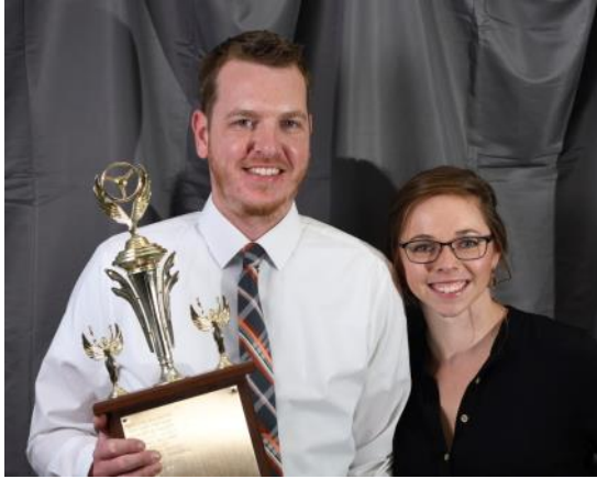
2019 New Member of the Year