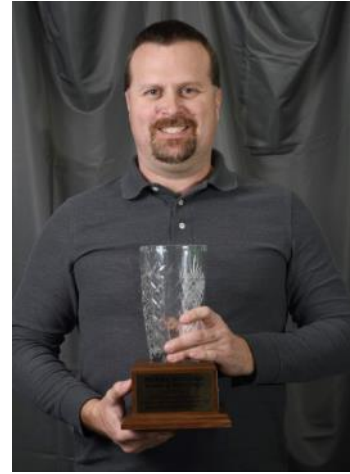
2019 Norma Williams Award of Excellence