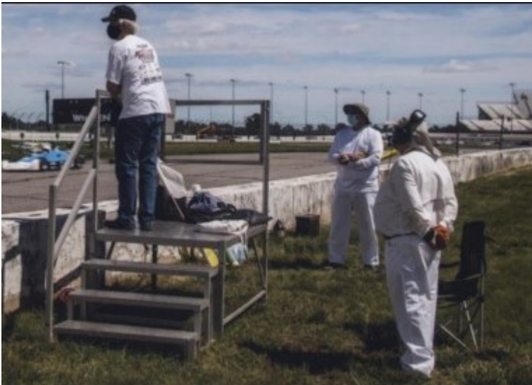
Corner Crew practicing social distancing and wearing masks at St Louis.

If you are considering going to an event soon, I admit that it is a long hard think to determine if one should venture out and it is personal. All of you are going through the same examination to see if this is the right time to venture back to the track. The main points are to come prepared to follow the guidelines set out be the SCCA and the CDC. We need to be diligent, not only for ourselves but for our fellow SCCA community. This will help keep us all safe and healthy so we may continue to enjoy the sport we all love. Good racing everyone.