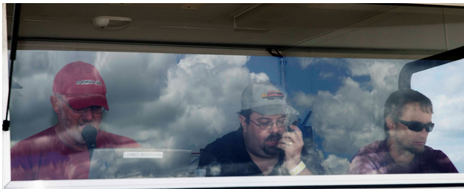
No, this is not the Three Stooges!

T&S consists of three job specialties: Announcer, Data Entry and Recorder/Control. These workers are housed in the timing trailer (we've got A/C!) where they have a clear view of the entire course and can concentrate on recording car numbers, times, penalties, and also communicating with Course, Grid, Start, Safety and the competitors out in Grid via the PA system.