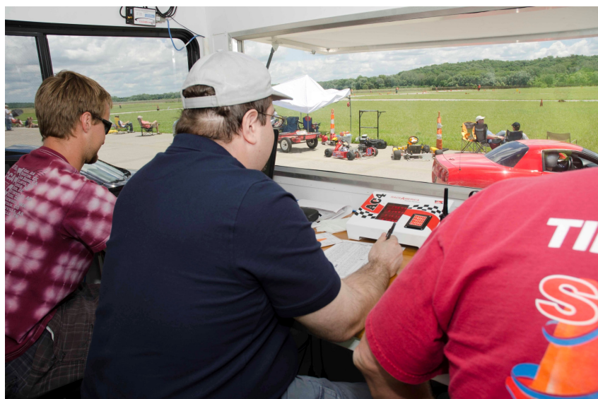
Control, Control, who's at Control!?!