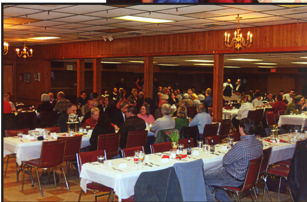
Crowd at the Banquet