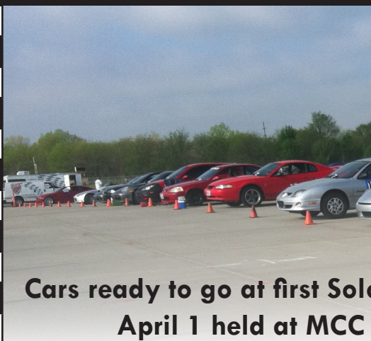
Cars ready to go at first Solo event April 1 held at MCC in Independence, MO

A PUBLICATION OF THE KANSAS CITY REGION SCCA