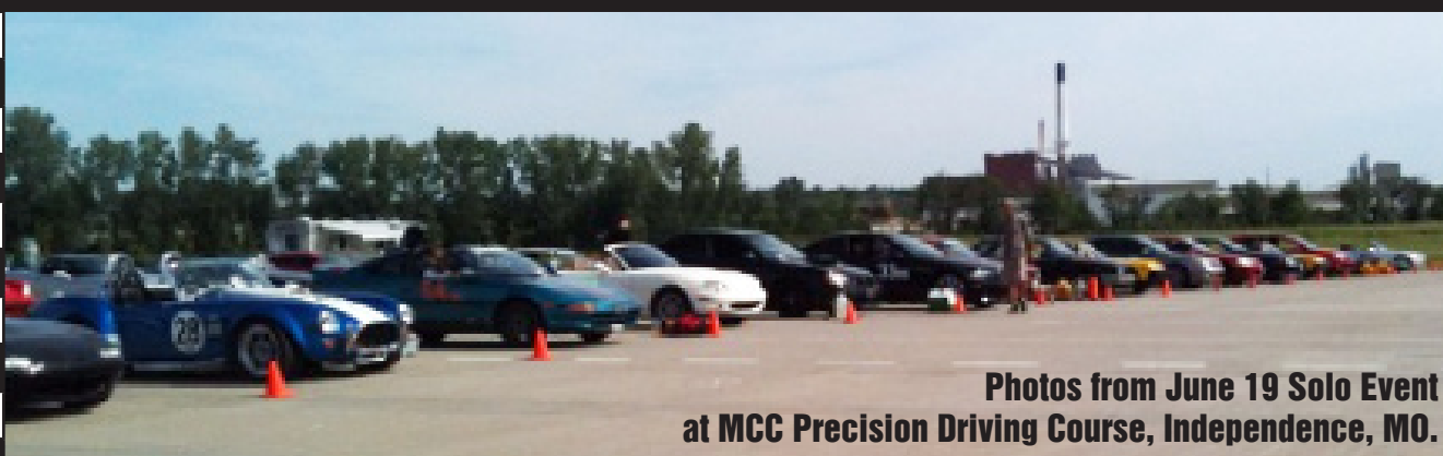
Photos from June 19 Solo Event at MCC Precision Driving Course, Independence, MO.

A PUBLICATION OF THE KANSAS CITY REGION SCCA