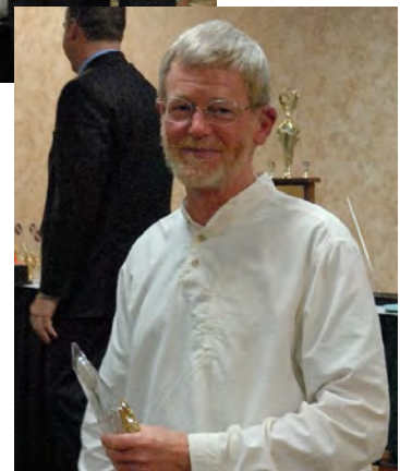
Dick Van Benschoten Street Tire