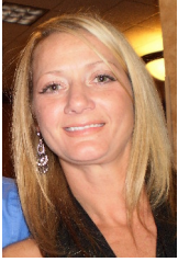
AS/ASL ASP/ASPL BM