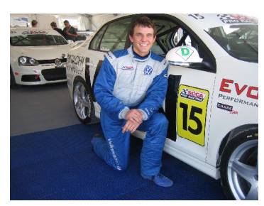
Alton, VA. - The Volkswagen Jetta TDI Cup made its first appearance in North America supporting the Rolex Grand-Am race April 25-27<sup>th</sup> at VIRginia International Raceway. The first race series of its kind, 30 factory-prepared and managed 2009 Jetta TDI clean-diesels were piloted by up-and-coming drivers, ages 16 to 26

Although the cars came off the regular Jetta assembly line, the engines and transmissions were built and installed by a special team, then tested to ensure car equality. Each car is powered by a 2.0-liter, four-cylinder TDI, clean diesel engine. To highlight its environmental devotion, Volkswagen has partnered with Carbonfund.org to certify the entire race series as carbon free.