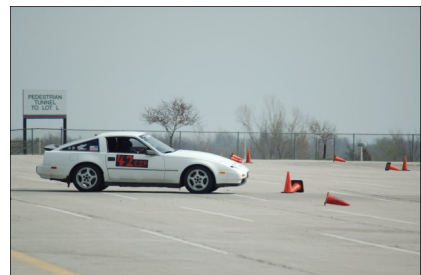
You tell us whose cars these are.