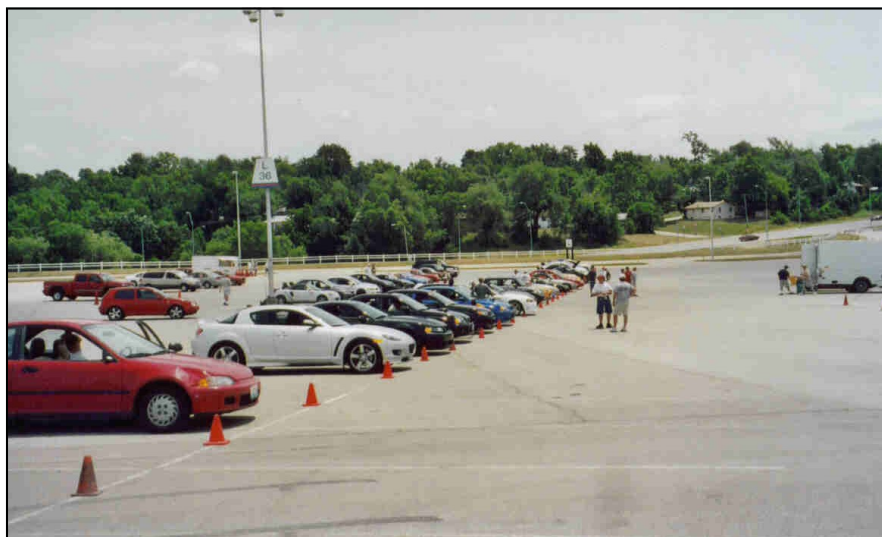
The Solo paddock at Truman Sports Complex