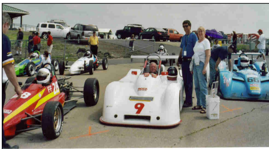
The Formula Cars on the Grid at Heartland Park Topeka